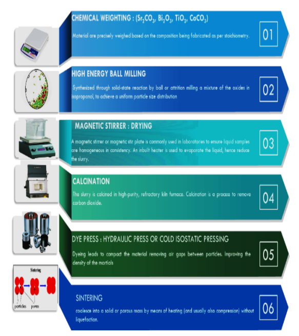
Fig. 2 – Flow chart: preparation of lead-free piezoelectric ceramics

for 4 h. Then the powder sample is subjected to calcination at 825 °C for 2 h. As the compounds are taken in the form of oxides and carbonates, the process of calcination will help remove carbon dioxide, leading to the formation of the balanced stoichiometry of the compound. Using the desired die of known diameter, the samples are pressed into pellets. The pellets are then sintered at 1200 °C to obtain the final densified samples [2, 3].