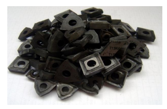
Fig. 1 - Waste of sintered hard alloy brand T15K6

The fulfilled multifaceted disposable plates from the corresponding grades of sintered hard alloys are also used as electrodes.