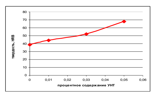
Fig. 1 – The Schedule of dependence of hardness polymer material percentage in it \ensuremath{\mathrm{CNT}}

Analysis of the results obtained in the experimental part, has allowed to conclude that even small doping of carbon nanotubes in the total volume of the polymer matrix "Carbogen" (0,05 %) almost in 2 times increases the strength of the material. This provides significant operational improvement dental plastic without critical deterioration of its color characteristics. Figure 1 shows the graph of the hardness of dental material percentage of carbon nanotubes.